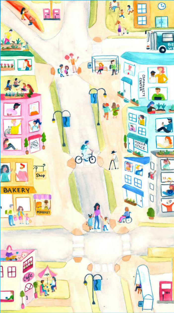
Illustration of 6th Avenue East by Tiffany Fenner